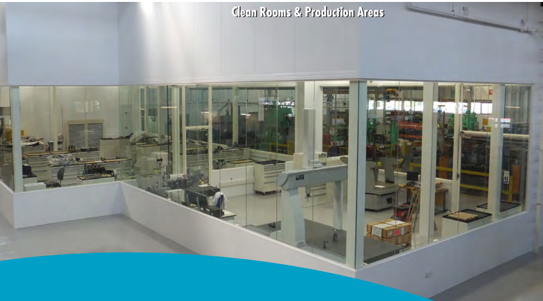
Clean Rooms & Production Areas