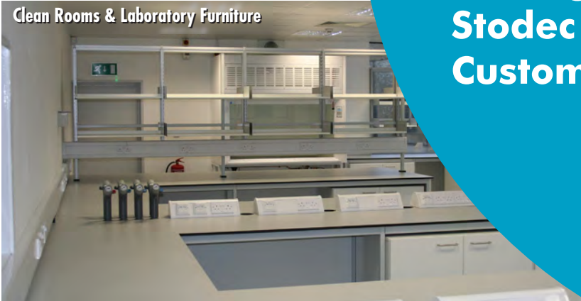
Clean Rooms & Laboratory Furniture

Flexible and Competitive Finance Packages for Stodec Group Customers